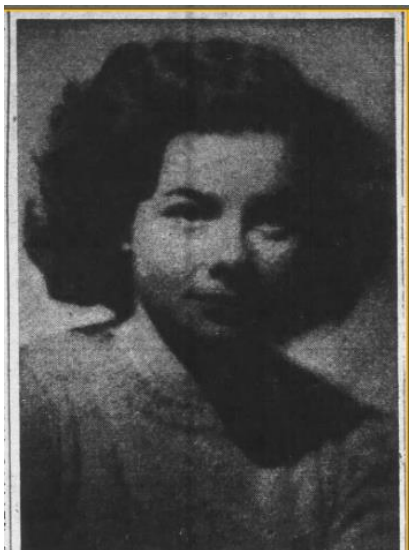
Married at Catholic Rites